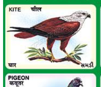
CHART NO. 110 www.spectrumchart.com